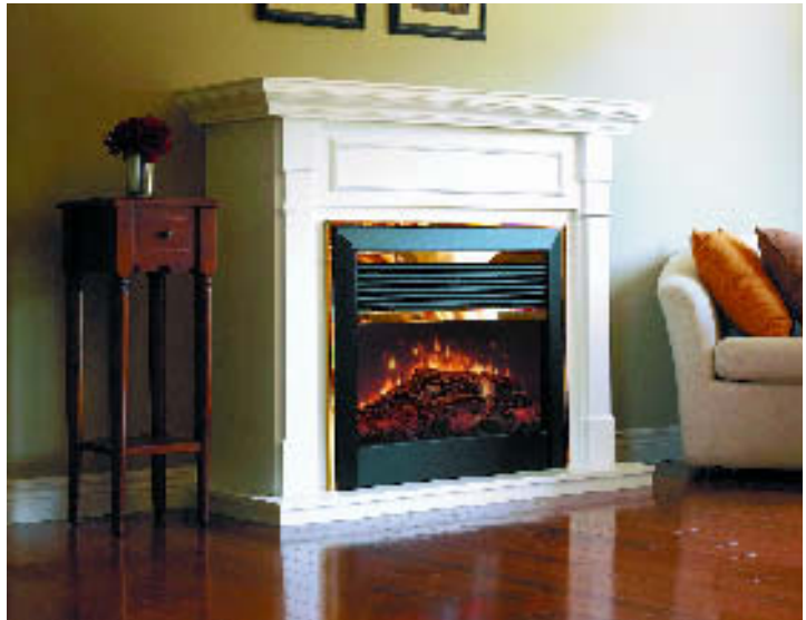
BF5000NT firebox shown in white cabinet (SM-W-222) with 3" black and polished brass trim (ST-3-BLKPB)